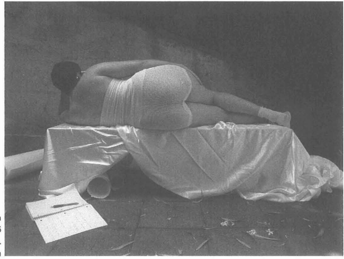
Emily Roysdon Living the Sacrifice, 2006 Super 8 film with sound, 7 mins.

The summer we released Issue 5, I made Living the Sacrifice , and after reading my editorial to the issue it is easy to see each project was affecting the other. Living the Sacrifice is a video about language and an idea I have about the impossibility of articulating the real pleasure of having been a part of something. I push against "the impossible" and experiment with different forms of affective speech. I wanted to make a tribute to the many voices that live in one historical body, and how we animate the histories that we live with. It is a seven minute Super 8 film in which I am lying on a low classically draped table, hinting at a deathbed, speaking. The text is written so as to create a desire in the viewer to be able to understand the message. I want you to want to understand, but I do not know if I can share it, if I have the tools, if the tools fit the situation. I offer no narrative about what I have done that I feel is important to share. Sometimes I just start to sing "No, no ... no, no, no" and then "You, you, you." I wanted to challenge a certain veracity of interpretation—like this person clearly experienced something significant, but what kind of evidence do we need to relate?