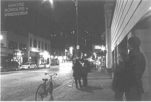
Figure 7: 100 Ways To Save A City.

that draws attention to the changing patterns at play in the environment; it raises the perception of the environment to high intensity or high definition. The Green Corridor Project draws upon the old environment of the automobile and of manufacturing as its content and pits them against the new environment of integrated and interconnected mediated spaces. In opposition to the politics of trade, security, and terror, Broken City Lab highlights the border as new kind of screen or filter, a space of dialogue, connection and imagination rather than partition and concealment. In each project, the border itself is transformed into an art form. In his conception of a “city without walls” in the electric age—a connected, fluid and continuous global sphere—McLuhan anticipates such borderless cities, an idea to which the local image of “Windsoria” gestures. By illuminating the border as a reflective space, these projects work to overcome the rupture between city, community, environment, art, and industrialization in the Windsor-Detroit area. Their common goal of achieving a “total environment” resuscitates the universality of a new humanism that emerged in post-war urban utopianism, represented by calls, such as Giedion’s, for a “dynamic equilibrium” and urged forward by urban design programmes such as CIAM.