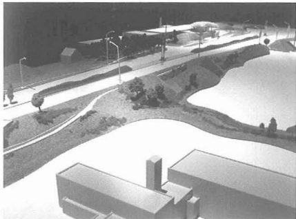
Figure 4: Assumption High School and Wetlands.

The project's most successful physical installation is the Nature Bridge , a pedestrian overpass completed in 2005 in partnership with the city of Windsor. This pedestrian bridge spans Huron Church Road at Assumption High School, mere kilometres from the border and the Detroit River, allowing for safe passage of pedestrians across the broad roadway and above vehicle traffic thundering below. At once passageway and environment, the bridge is the first step in the Huron Church Road Urban Design Master Plan, which envisages the surrounding area as a "total environment" integrating elevated landform patterns and wetlands with buildings, street lighting, surface materials, and public artworks. To this end, the structure of the Nature Bridge can support wind turbine and solar panel installations to power lighting and bridge irrigation, a system connected to the nearby wetlands.