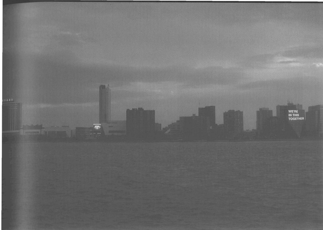
Figure 6: Windsor Skyline and the proposed Cross-Border Communication project.

During their proposed Cross-Border Communication project, a series of interventions “based on the desperate need to communicate with Detroit, Michigan, from Windsor, Ontario,” the group will use a 6000-lumens projector to project messages, such as “We’re In This Together,” onto the Canadian Imperial Bank of Commerce building facing Detroit.