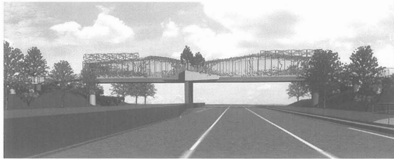
Figure 3: The Nature Bridge 3D Rendering.

The project's most successful physical installation is the Nature Bridge , a pedestrian overpass completed in 2005 in partnership with the city of Windsor. This pedestrian bridge spans Huron Church Road at Assumption High School, mere kilometres from the border and the Detroit River, allowing for safe passage of pedestrians across the broad roadway and above vehicle traffic thundering below. At once passageway and environment, the bridge is the first step in the Huron Church Road Urban Design Master Plan, which envisages the surrounding area as a "total environment" integrating elevated landform patterns and wetlands with buildings, street lighting, surface materials, and public artworks. To this end, the structure of the Nature Bridge can support wind turbine and solar panel installations to power lighting and bridge irrigation, a system connected to the nearby wetlands.