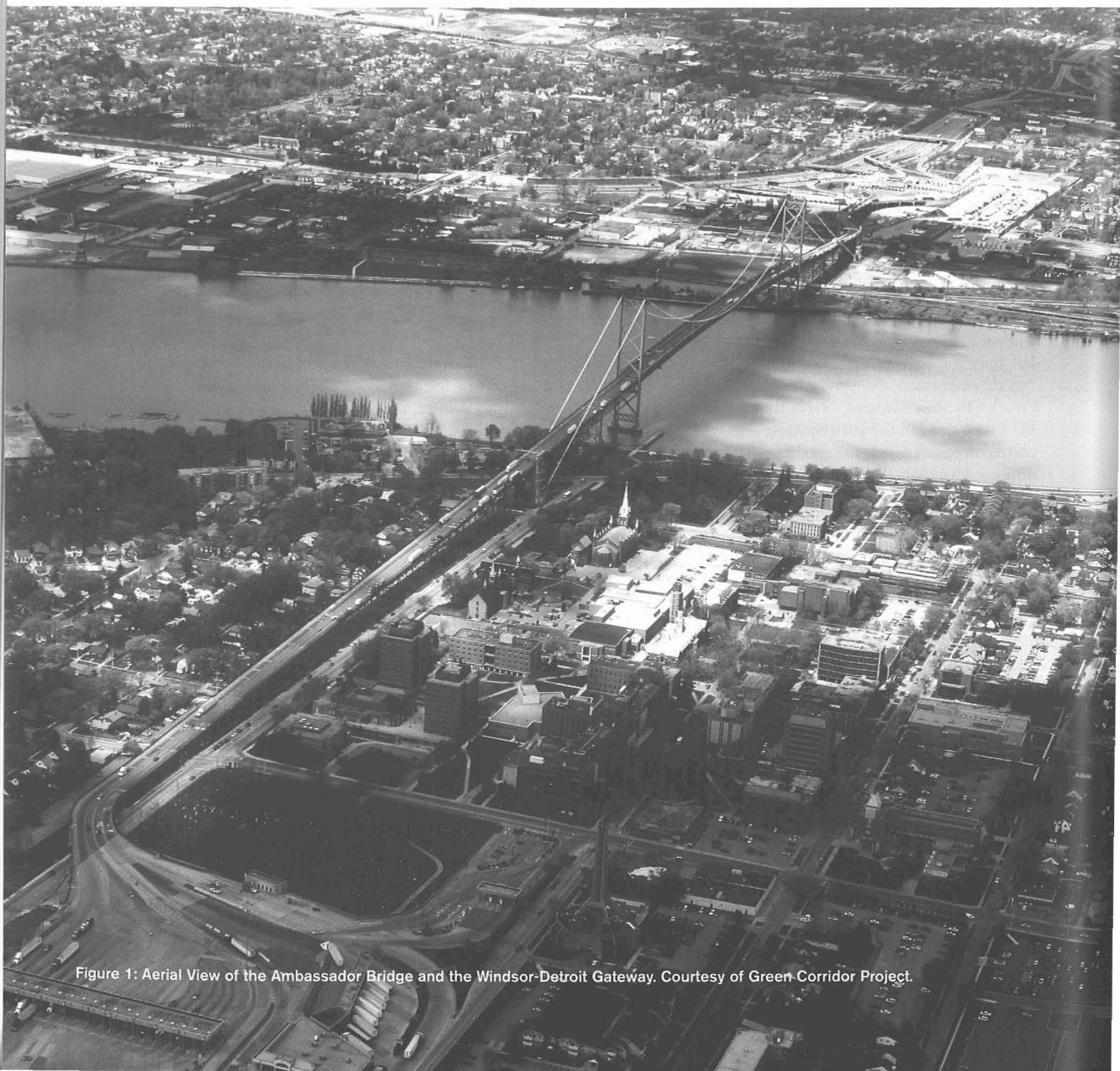
Figure 1: Aerial View of the Ambassador Bridge and the Windsor-Detroit Gateway.