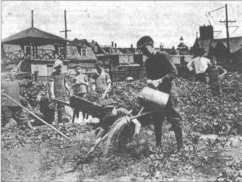
Boy gardeners at the Garden City (page 91, The Agricultural Gazette of Canada , 1916). Reproduced with the permission of the Minister of Public Works and Government Services Canada, 2010.